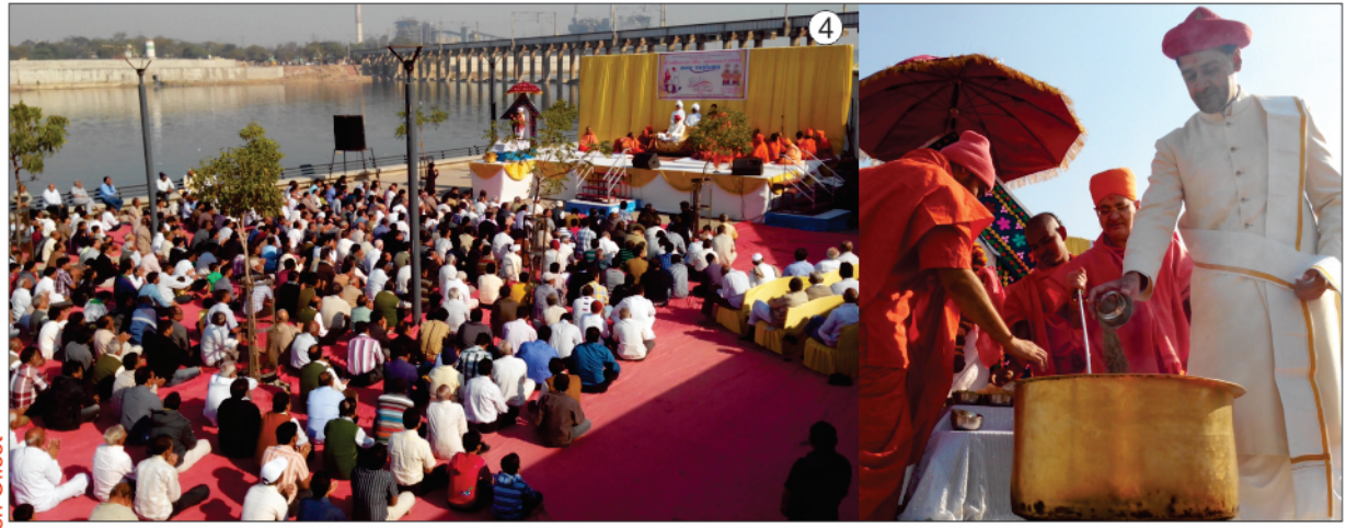
(1) The legend of Century and Bollywood celebrity Amitabh Bachhan performing divine Darshan of Shree Narnarayandev in Ahmedabad temple and Shri Mahant Swami and Brahmchari Poojari Rajeshwaranandji offering garlands to the legendary Bollywood actor. (2) H.H. Shri Mota Maharaj performing poojan of Shri Shiksha Patri in Ahmedabad temple on the pious occasion of Vasant Panchmi. (3) Shakotsav Darshan in Toronto Canada temple. (4) H.H. Shri Acharya Maharaj performing Shakotsav in Naranghat temple.