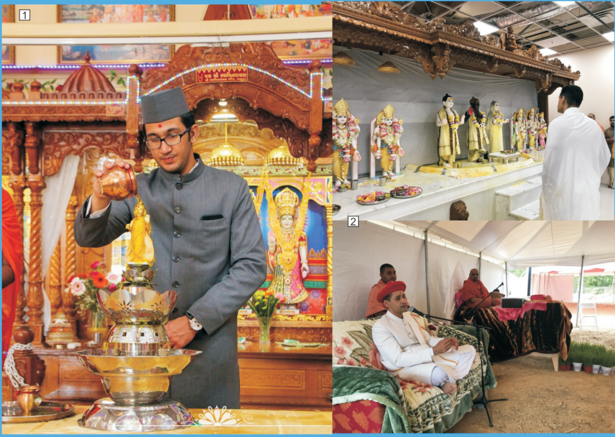
(1) H.H. Shri Lalji Maharaj performing Abhishek of Thakorji on the occasion of 12th Patotsav of Shree Swaminarayan temple, Sydney (Blacktown). (2) H.H. Shri Acharya Maharaj performing Murti-pratistha in Jacksonville (America) temple and granting blessings in the Sabha.

Registered under RNI - No - GUJENG/2007/20198 " Permitted to post at Ahd PSO on 11 the every month under postal Regd. No. GUJ. 582/15-17 issued SSP Ahd Valid up to 31-12-2017